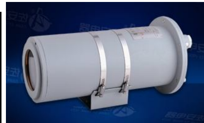
ZAF105 CORROSION PROOF PAINTING